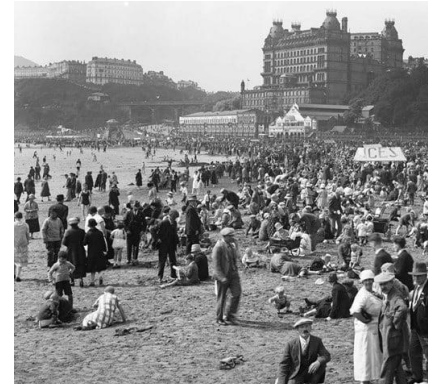
Herbivore, Carnivore, Omnivore Sort Control Chart